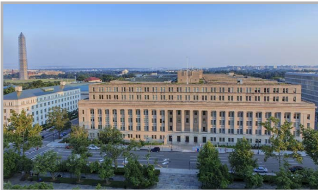
OSMRE Headquarters, Main Interior Building, Washington DC

With the ultimate goal of tribal sovereignty, the development and use of tribal energy resources will only accelerate this notion that sovereignty is, in fact, 100% attainable. For more information, please visit their website at https://www.bia.gov/bia/ots/demd