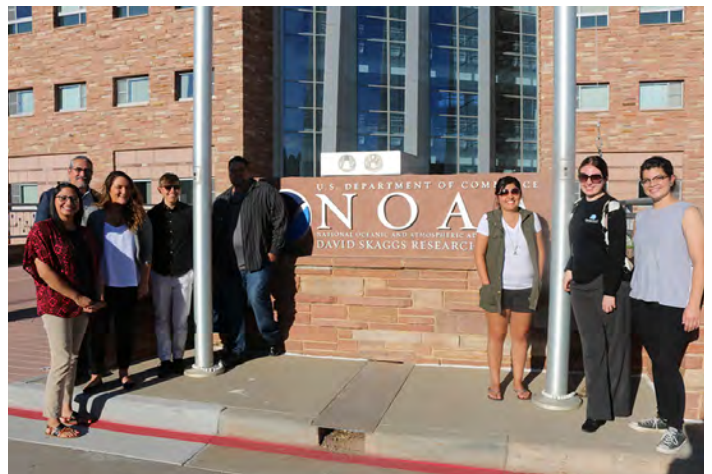
PHOTO: Haskell students in the front of the NOAA building in Boulder, CO.