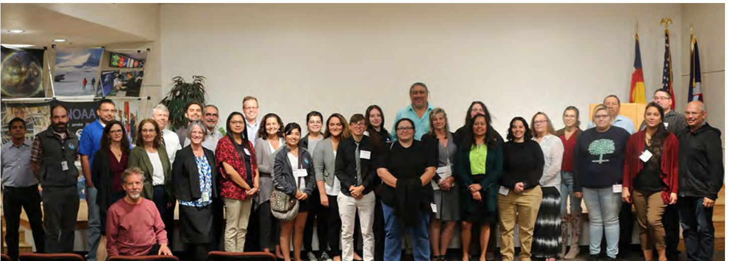
PHOTO: TCU students and faculty, speakers and planning committee members at the NOAA TCU Science Day.