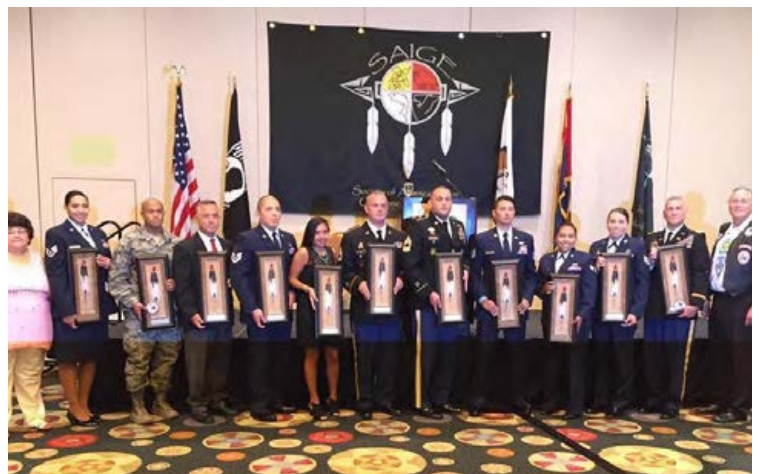
PHOTO: 2017 Meritorious Military Award winners.