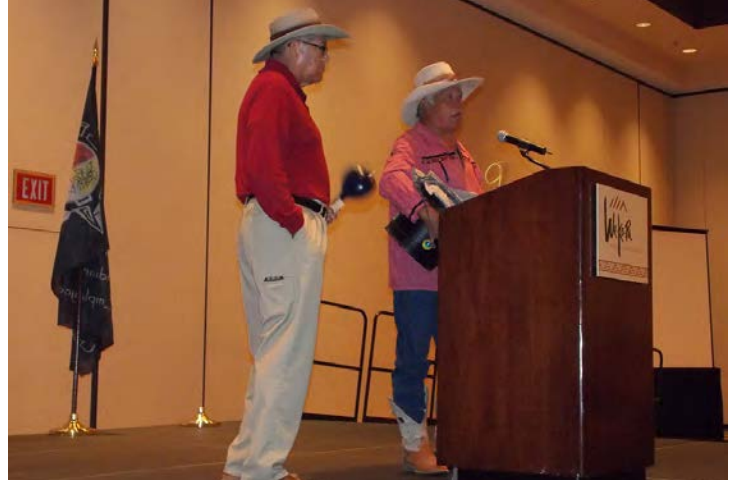
PHOTO: Welcome from Fort McDowell Yavapai leaders.