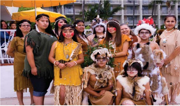
Chumash Dancer

From the opening cultural night featuring the Chumash dancers from Ventura County, to the closing Youth Track skit, the Sixth Annual SAIGE conference in San Diego, CA was a huge success.