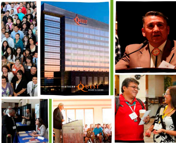
and taken at SAIGE 2012 National Training Program, Denver, CO.

Northern Quest Resort & Casino - Kalispel Tribe of Indians