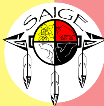
Society of American Indian Government Employees