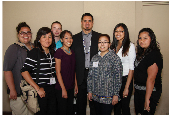
SAIGE Conference